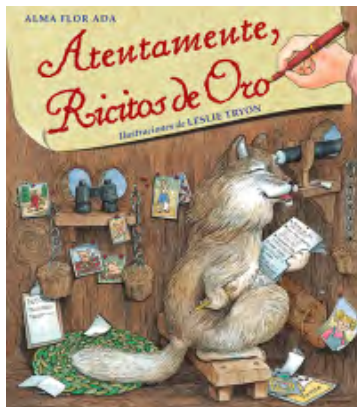
Mentor Text for Correspondence: Atentamente, Ricitos de Oro