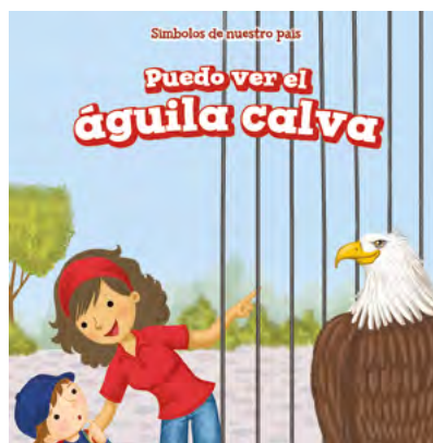
Mentor Text for Informational Text: Puedo ver el águila calva