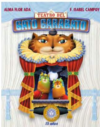
Mentor Text for Drama: Teatro del gato Garabato