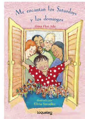
Mentor Text for Personal Narrative: Me encantan los Saturdays y los domingos