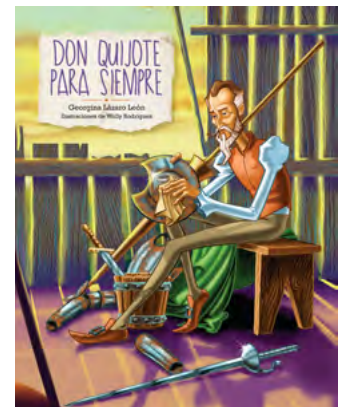
Mentor Text for Poetry: Don Quijote para siempre